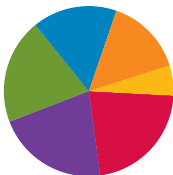
LBO Deals in Manufacturing & Industrials (2006 - 2016)

Within the Manufacturing & Industrials industry, the Building/Construction & Engineering sector led the way, accounting for 588 of the 2,671 transactions (22 percent) from 2006 to 2016. Closely in second was Machinery with 569 deals (21.3 percent), while Other Industrials came in third with 535 deals (20 percent).